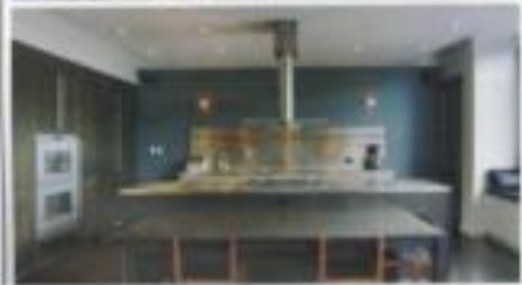
7 Easa Street #304 in Chinatown