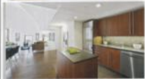
205 Second Avenue #702 in Greenwich