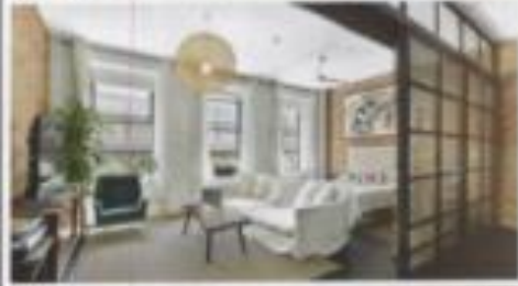
305 Broadway #5E in Tribeca