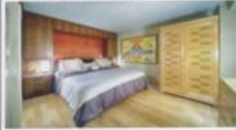
140 Charles Street #101 in West Village